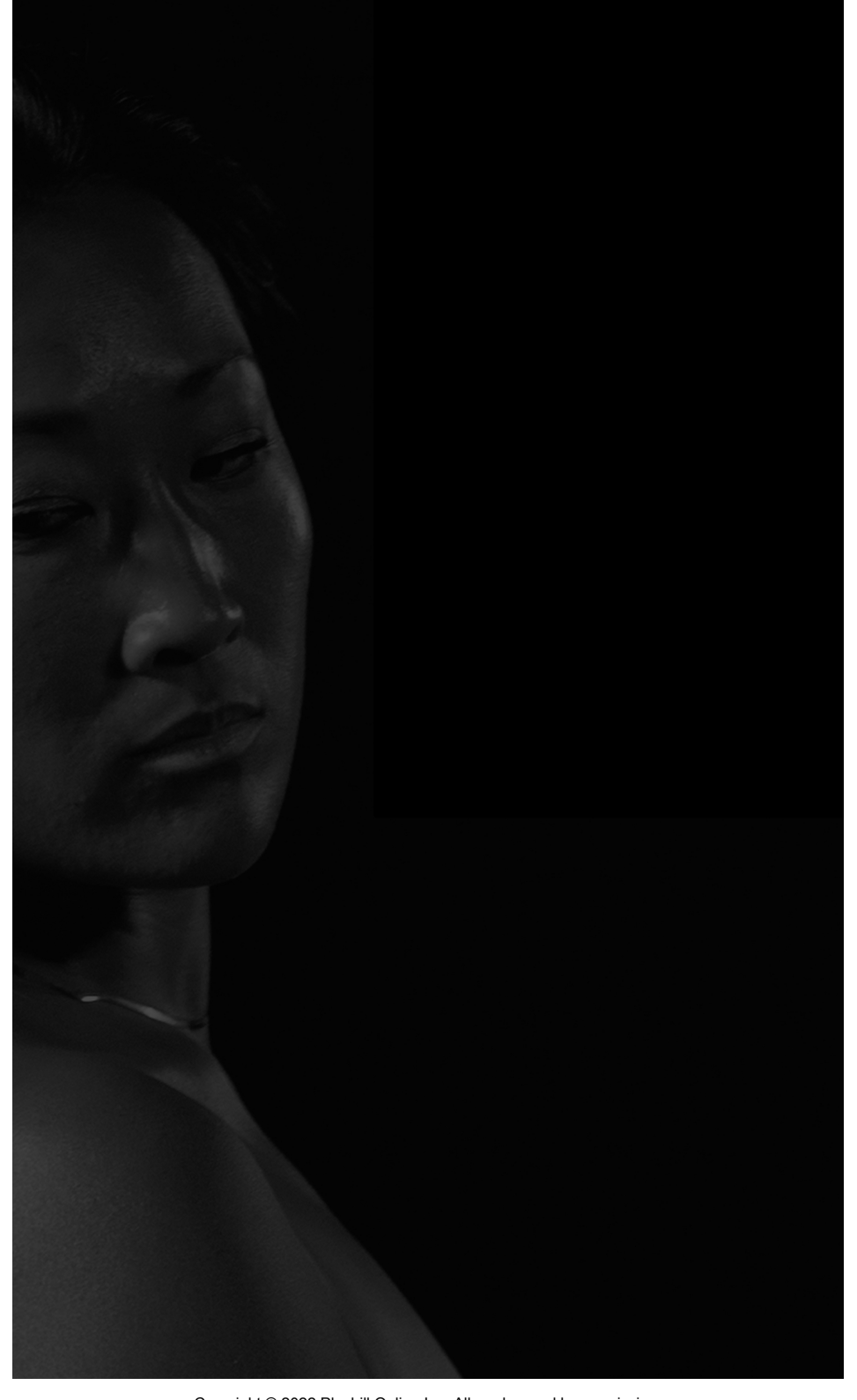
Copyright © 2022 Playbill Online Inc. All marks used by permission.